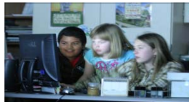
“Afters” Students Engaged in Learning After Hours.