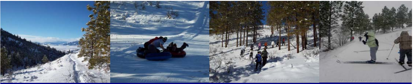
Fun in the Winter sun