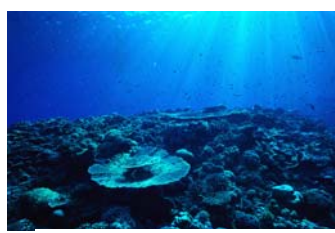
Dead fishes at the bottom Of the ocean