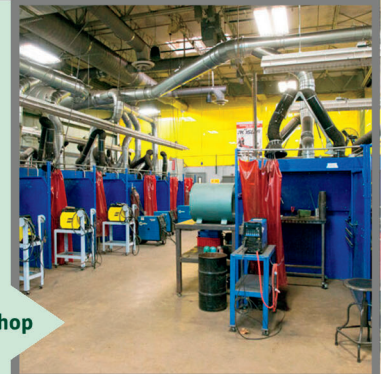
Example of an updated shop

Our shops lack the modern equipment and ventilation needed to prepare students for jobs in the trades.