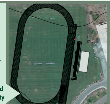
Mockup of updated track/soccer facility

Some senior and disabled homeowners may be eligible for a property tax exemption. For details call the Chelan County Assessor's Office at 509-667-6365 or visit co.chelan.wa.us